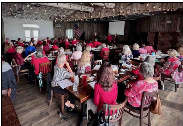
Members and Guest in Rapt Attention