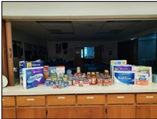
Food Pantry Items Collected at February Luncheon